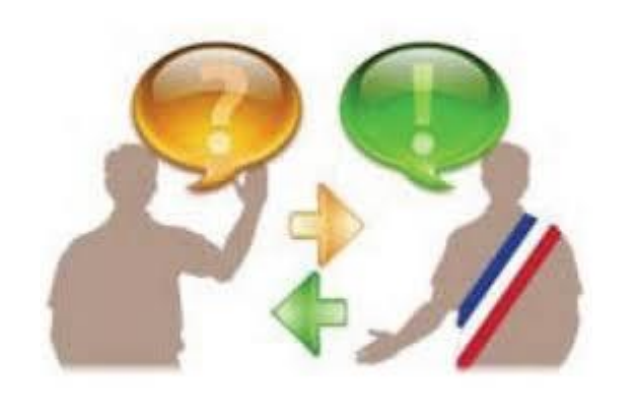
Simplify access by citizens to the urbanistic rules and maps