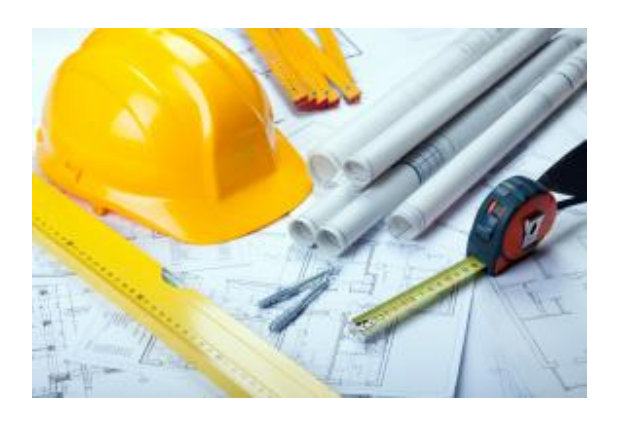
Facilitate urbanism stakeholders jobs