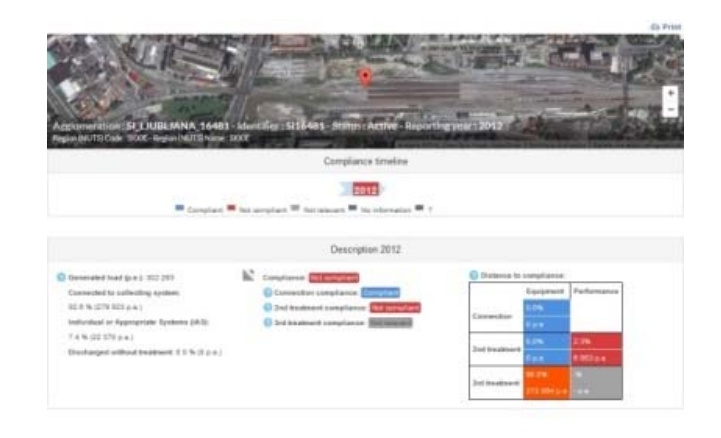
Automatic compliance calculation